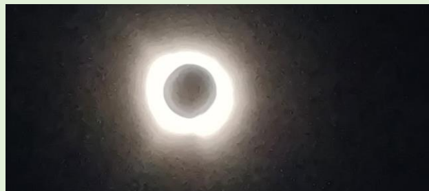
Top four photos of Tollgate eclipse Bottom photo of total eclipse from Texas